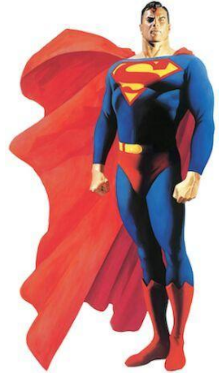
Superman (Kal-El) - Last surviving being from the dying planet Krypton, Superman is sent to earth by his parents and becomes incredibly strong from our yellow sun.