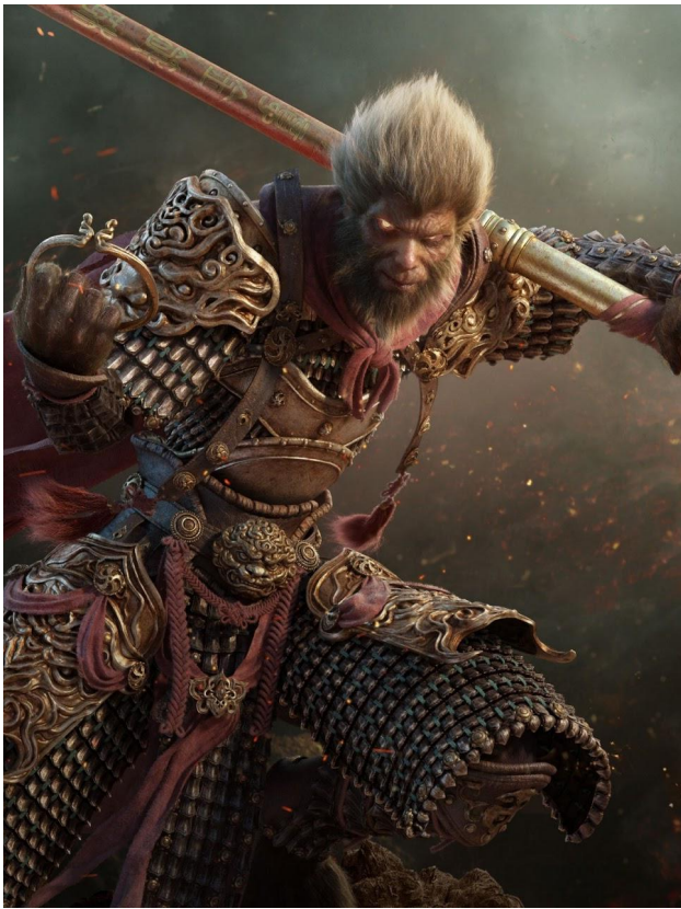
Sun Wukong (The Monkey King) from Chinese and Taoist mythology.