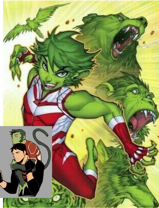
Beast Boy, Garfield “Gar” Logan from the DC universe.

Beast Boy, whose human name is Garfield “Gar” Logan, contracted a rare disease called Sakutia when he was a child. His scientist parents, in an attempt to save his life, inject him with a serum from a West African green monkey. The serum saved Gar, but had the unintended effect of turning Gar’s skin, eyes, and hair green, and granting him the ability to metamorph into any animal that he is familiar with. Later, Gar will go on to become a young superhero joining various superhero teams like the Teen Titans.