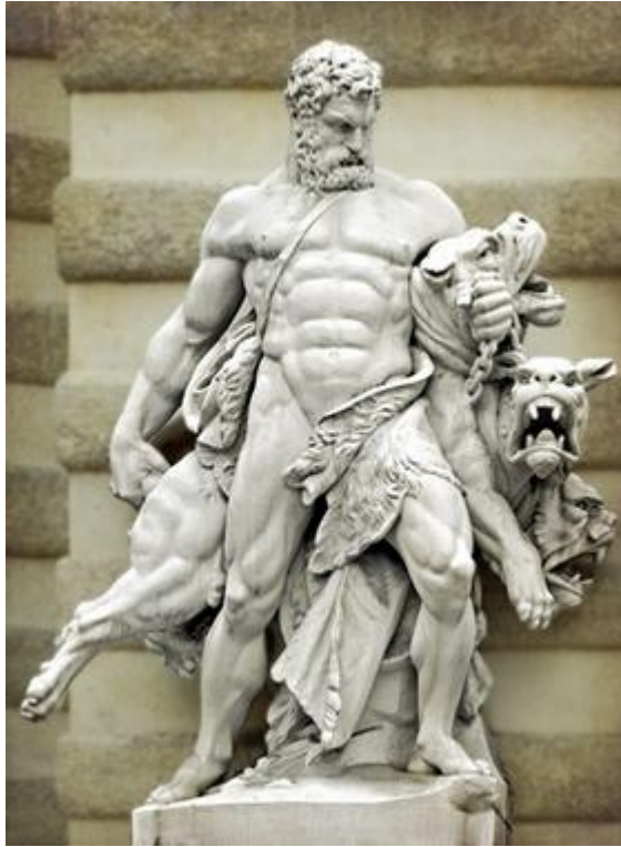
Hercules - Half son of Zeus and a mortal woman; demigod; had incredible strength and labored to save others.